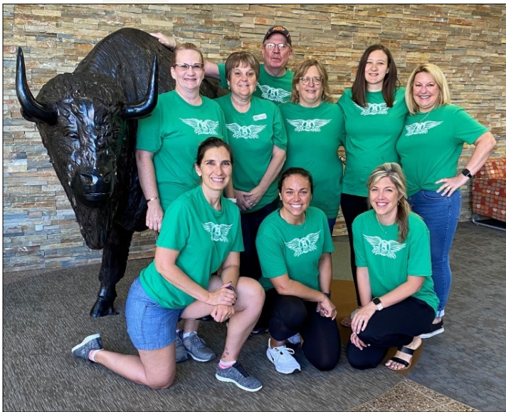
Walk this May team, "Bougie Buffalo," pose in front of their mascot. This picture was featured in the Prairie View Elementary yearbook with the caption: "Over 3,179,156 in May."

from having had COVID and the antibodies from the COVID vaccine).