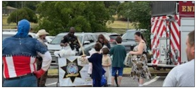
Saturday in the Park featured the Enid Fire Department and Garfield County Sheriff's Department as well as super heroes for the family to visit.

Our team has built long-term relationships with various health coalitions throughout our 11-county coverage area. We have had ground floor participation and development with the Oklahoma CHW (Community Health Worker) statewide organization to promote Community Health Workers as an emerging career field. Monthly meetings with the coalition work to develop training, curriculum, organiza-