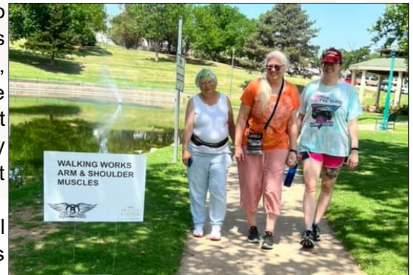
Participants of Walk this May during a group walk. TSET and Walk this May committee members placed signage in multiple parks to encourage walkers.